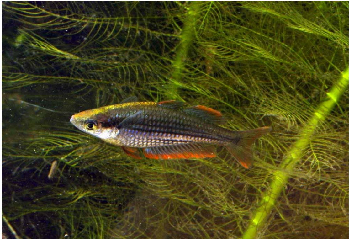
Blackbanded Rainbowfish, Melanotaenia nigrans – suitable for the community aquarium