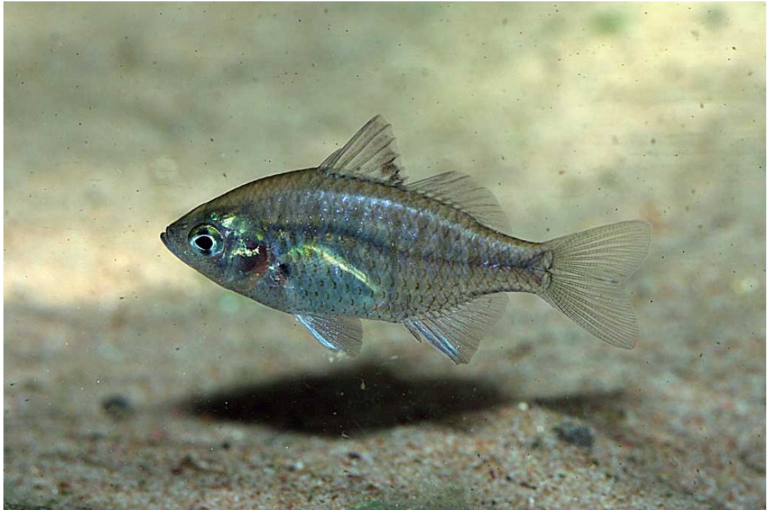
Sailfin Glassfish, Ambassis agrammis - suitable for the community aquarium