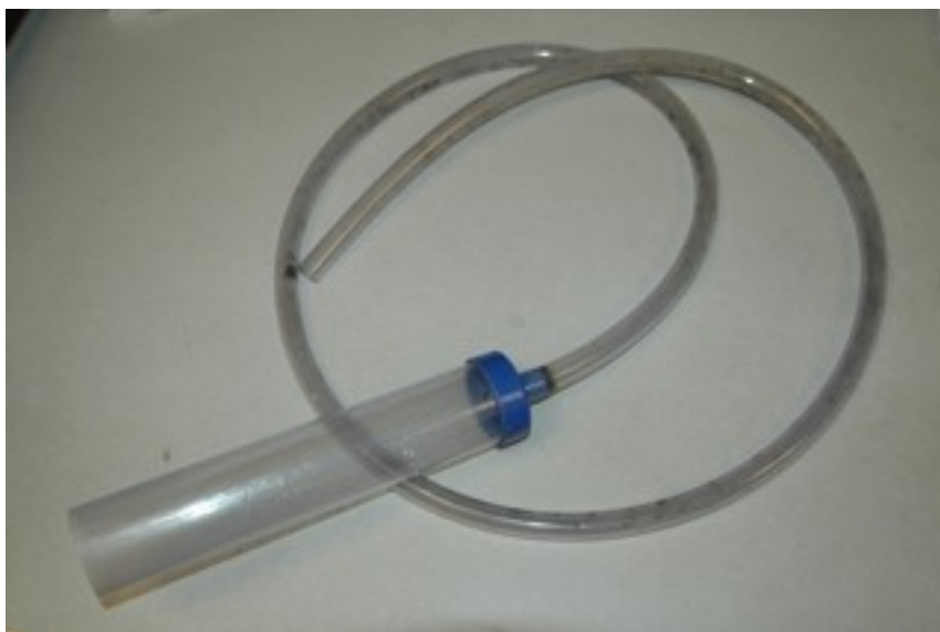
Gravel cleaner, siphon