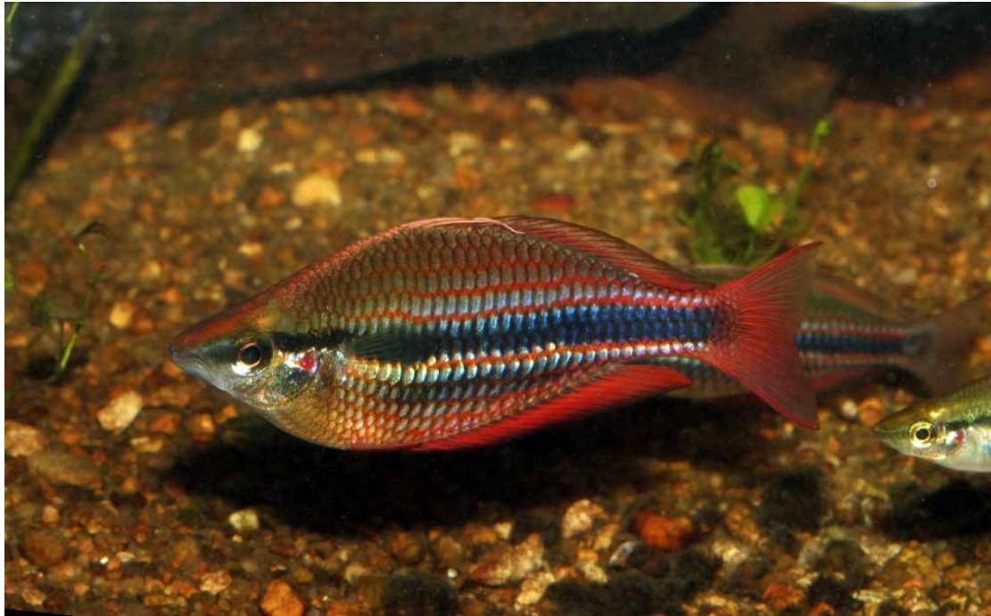
Chequered Rainbowfish, Melanotaenia splendida inornata - suitable for a community aquarium